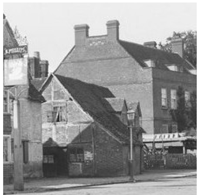
Cottages in 1891

Sometime after 1742 the Drake family acquired most of the houses in Amersham to make the town a 'pocket borough' where the Drake family controlled all parliamentary elections. It is not known exactly when this parcel of land was acquired.