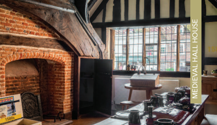
MEDIEVAL HALL HOUSE