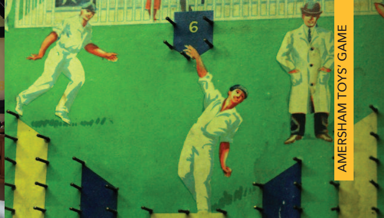
AMERSHAM TOYS' GAME