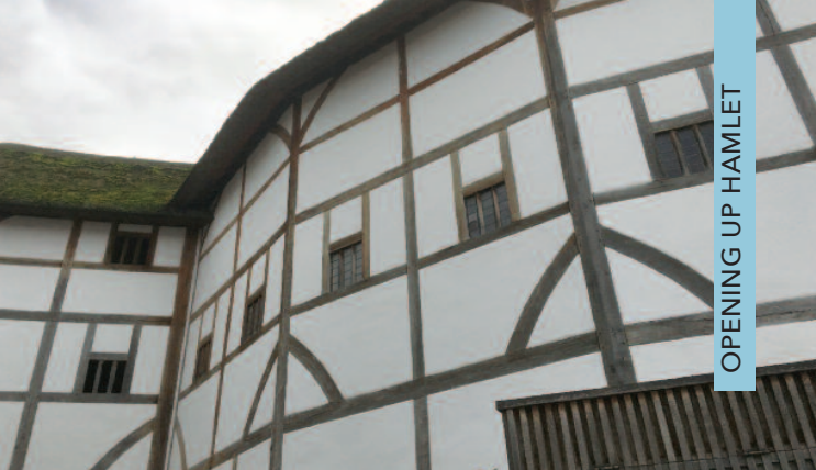
OPENING UP HAMLET