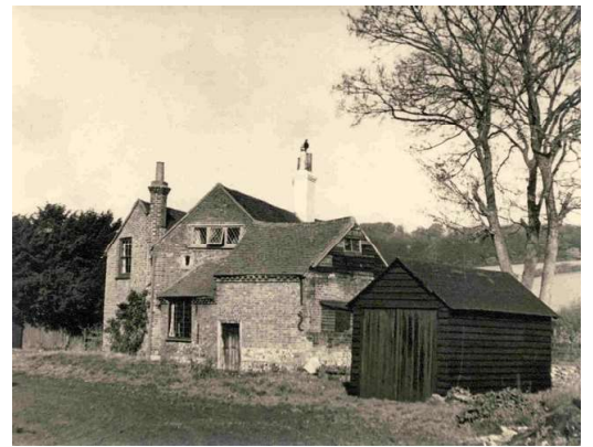
Bury End Cottage