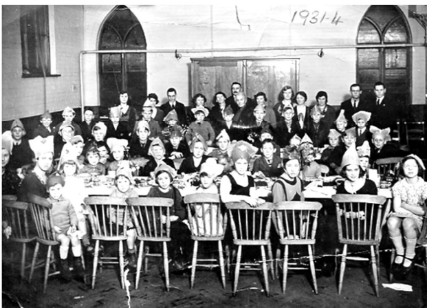
Sunday School c. 1931 - 34

By November 1974 the numbers had dropped to 35. Sadly, the numbers attending continued to decline and by September 2000 there were only 4 members so it was decided to close.