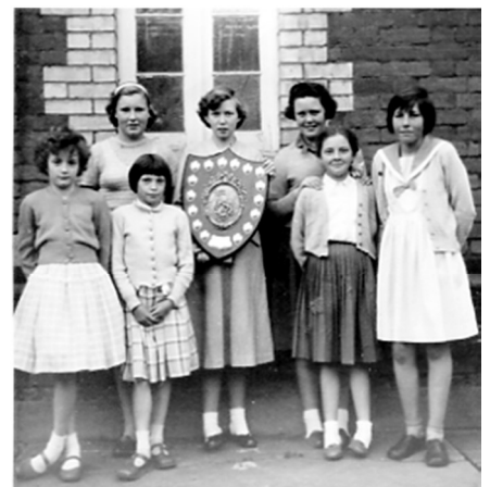
Scholars with 1960 Scripture Examination Shield