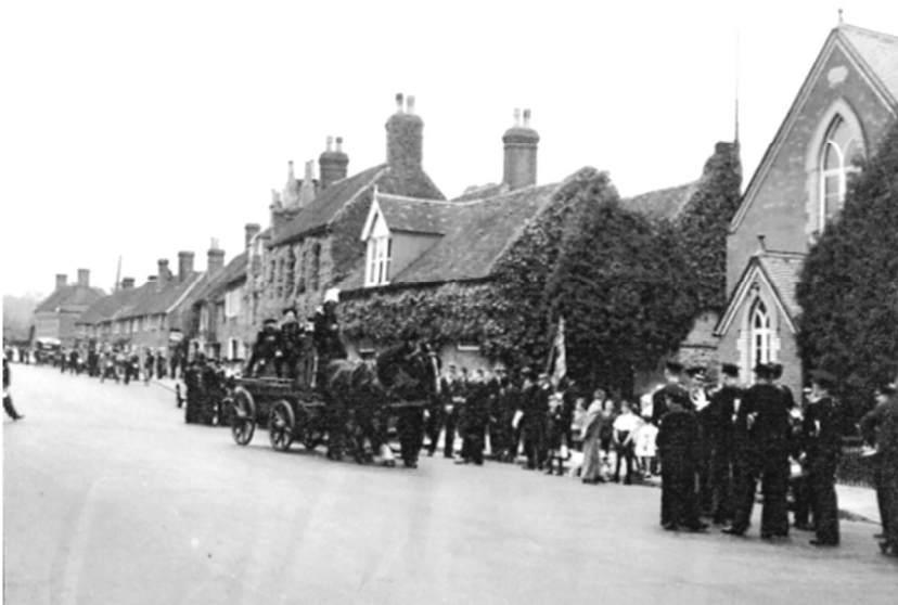
Town Band outside the Methodist Church c.1920's

There was no one for a time capable of taking a lead, or even looking after the property and it was too far from Wycombe for any of us to see to things - as an instance of their indifference, I may tell you, the WC attached to the place was sadly in need of repair, rather than repair it, the building such as it was - was pulled down."