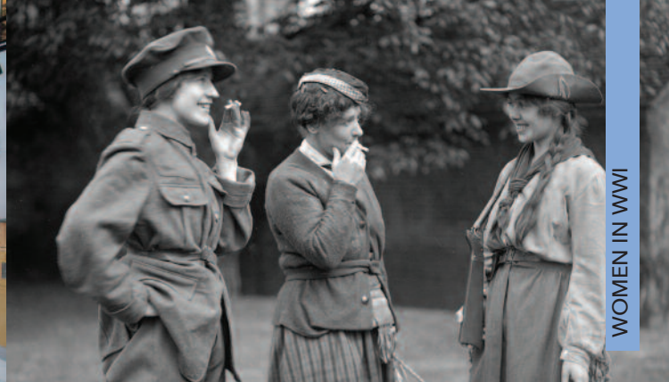
WOMEN IN WWI

Front cover: Unnamed VAD, by Car Richardson.