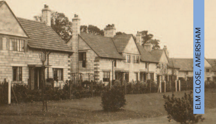
ELM CLOSE, AMERSHAM