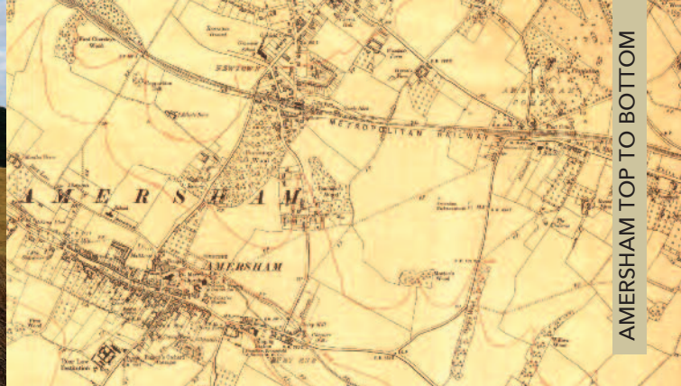
AMERSHAM TOP TO BOTTOM